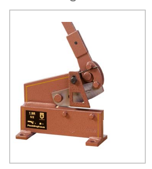
Plate and Round Steel Shears